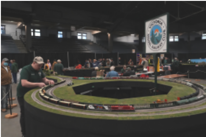
ABOVE: The staging loop for the VMRC layout, here with three trains waiting to get out on the layout.