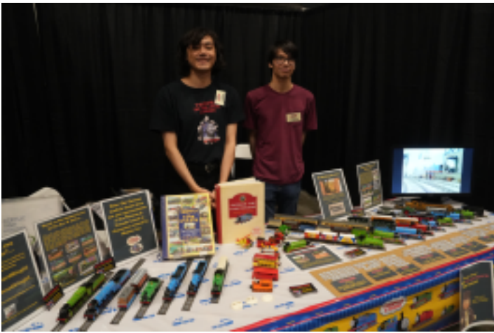
ABOVE: Two young exhibitors display an impressive array of material related to Thomas the Tank Engine.