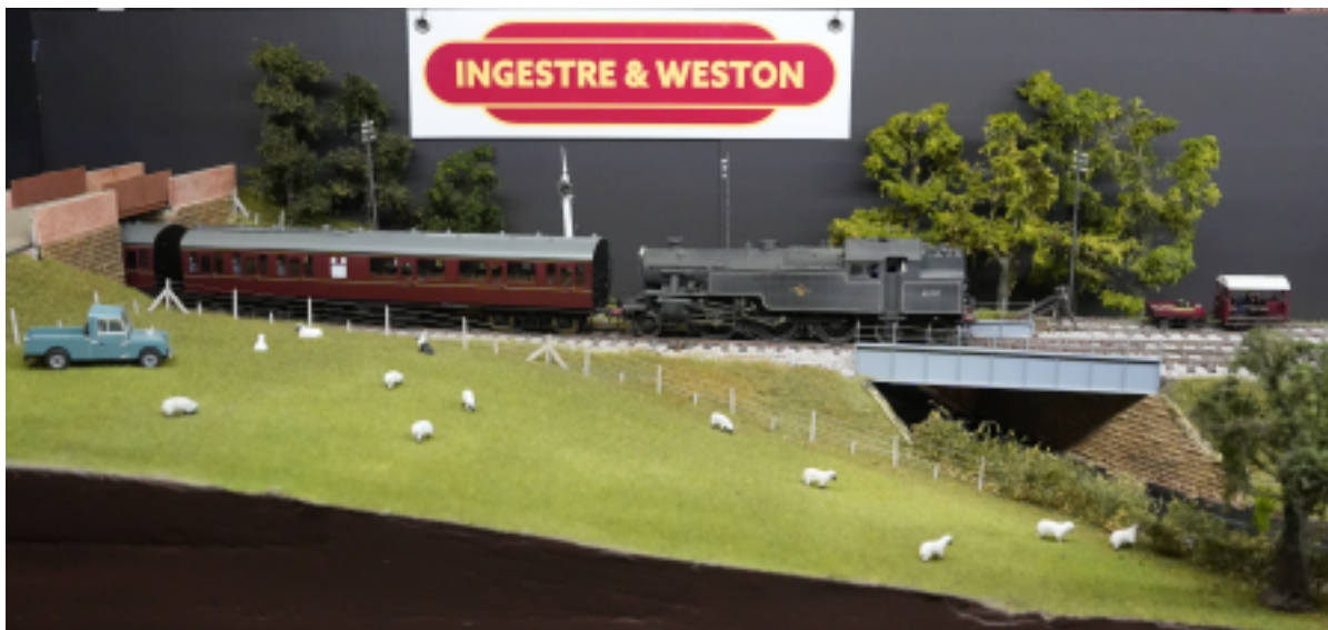
ABOVE: The show had two very nice British prototype layouts on display. This one showed a beautifully finished small country station, with a passenger train pulling into the layout from staging.