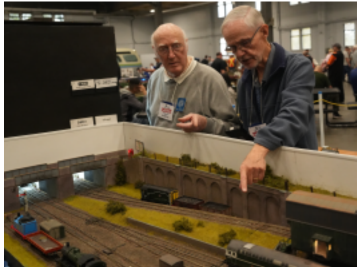
ABOVE: Two members of the Top Link Model Railway Association discuss the situation in their British prototype layout.