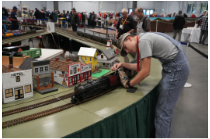
ABOVE: The Greater Vancouver Garden Railway Club's had a very popular layout at the show.