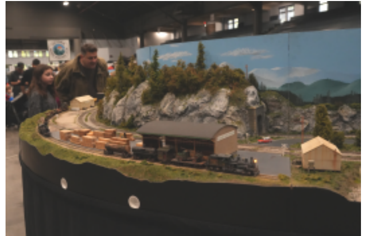
ABOVE: Another view of the VMRC layout, here showing some logging trains at work.