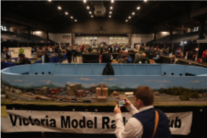
ABOVE: As you came in the door to VTEX 2023, this is what you saw: the large VMRC layout with a ton of activity beyond.