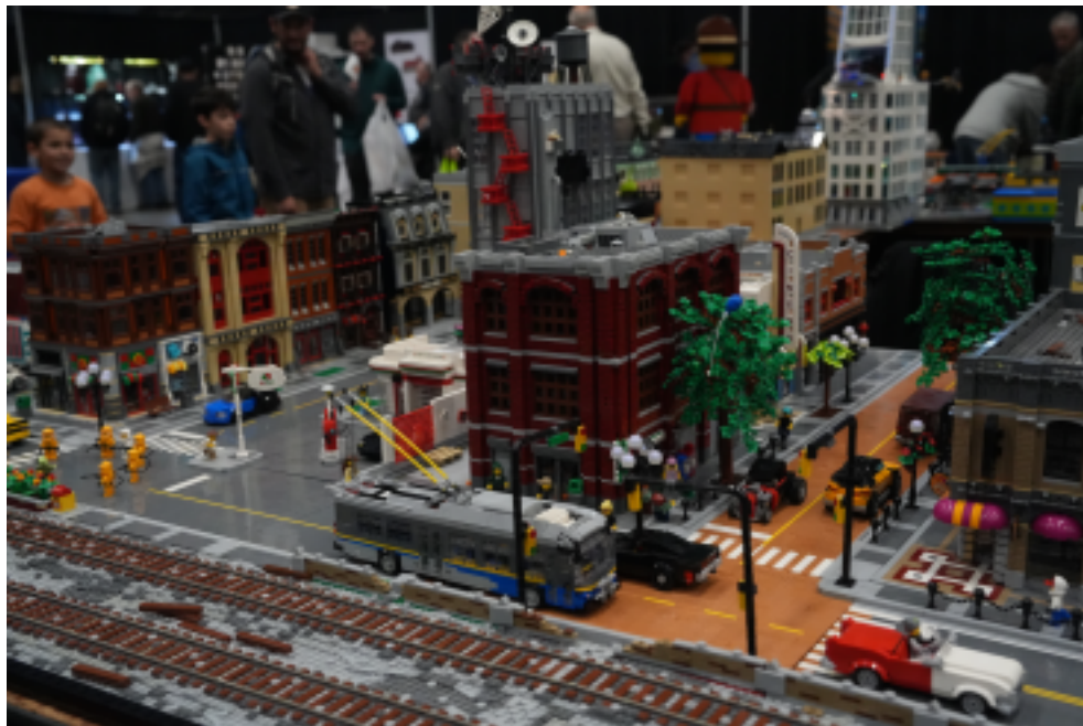
ABOVE; The Vancouver Lego Club had a very popular layout which won the People's Choice award.