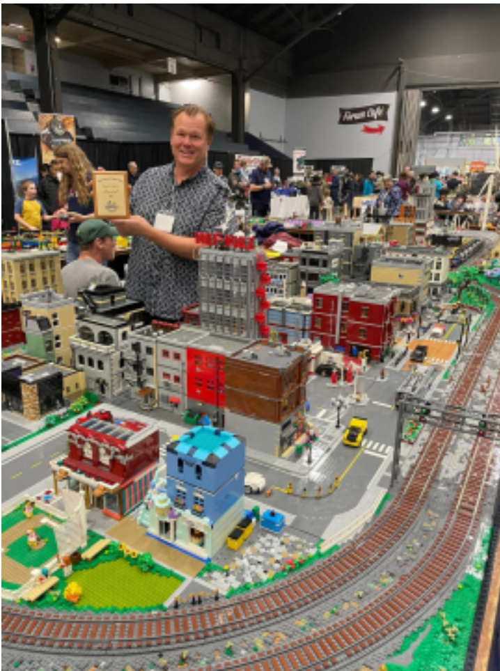
LEFT: The People's Choice Award was presented to the Vancouver Lego Club for their popular and vibrant display.