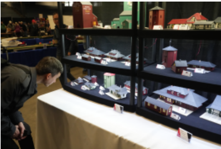
ABOVE: Monashee Laser Engineering had a steady stream of visitors to their attractive display.