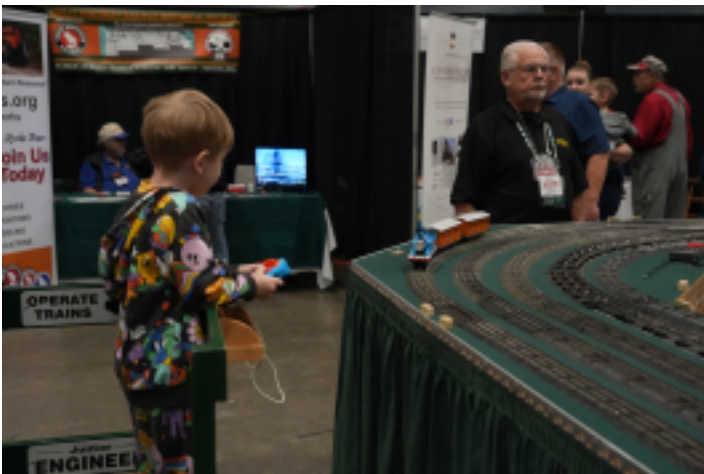
ABOVE: The Canadian Toy Train Association's layout is always a favourite for younger visitors. This young engineer is running Thomas the Tank Engine as it approaches to his right.