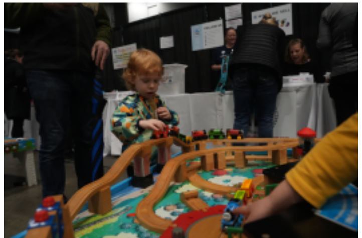
ABOVE: Another small visitor takes advantage of a large assortment of Brio trains.