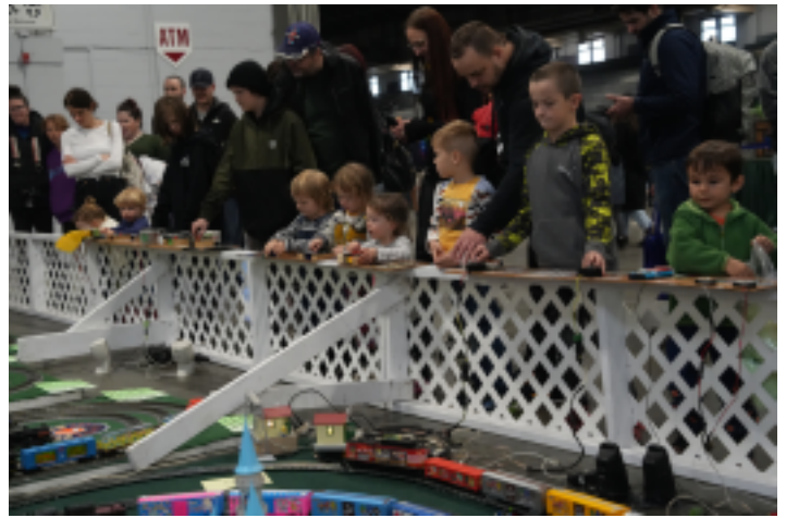
ABOVE: This was possibly the exhibit with the largest, youngest, and most enthusiastic group of people in attendance.