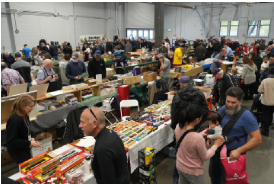
ABOVE: The Marketplace sales tables are always one of the most popular sections of the show. This year was no different.